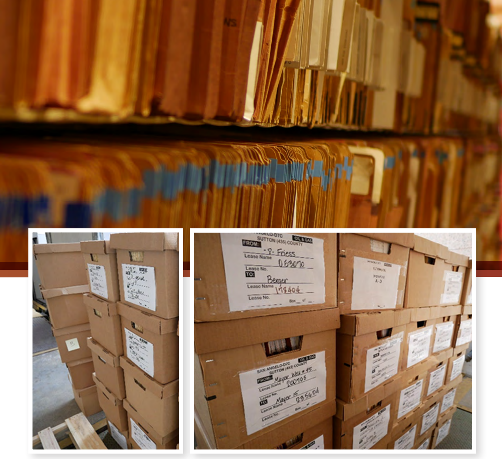
RRC District Office paper records transported for digitization

District office paper records and microfilm records that have been digitized can be found on the RRC website.